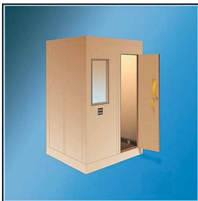
40a Classic Series

The 40a Classic Series Single-Wall (individual room) construction is a single or multiple occupancy room constructed of 4 inch thick modular panels, complete with carpeted vibration isolated floor, space-saver roof mounted ventilation, recessed electrical, Noise-Lock® doors and double glazed windows, audiometric jack panels acoustically matched and shipped ready for field installation.