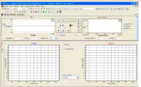
View simplified "audiogram" display during collection

M•A•S•T•E•R II is a must have addition to the clinical electrophysiological test battery especially when testing patients for whom behavioral audiometry may be unreliable, such as: