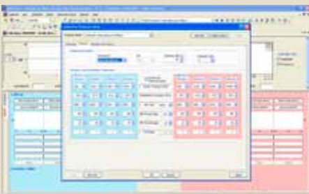
Create your own protocols and sequences

M•A•S•T•E•R II provides an objective measure of a patient's hearing thresholds for workers' compensation evaluation.