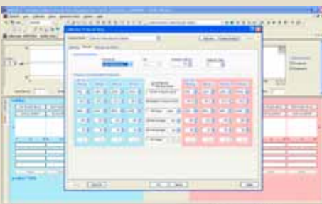
View data details during collection and stop individual frequencies when response significance is achieved